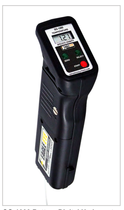
SG-1000 Battery Digital Hydrometer